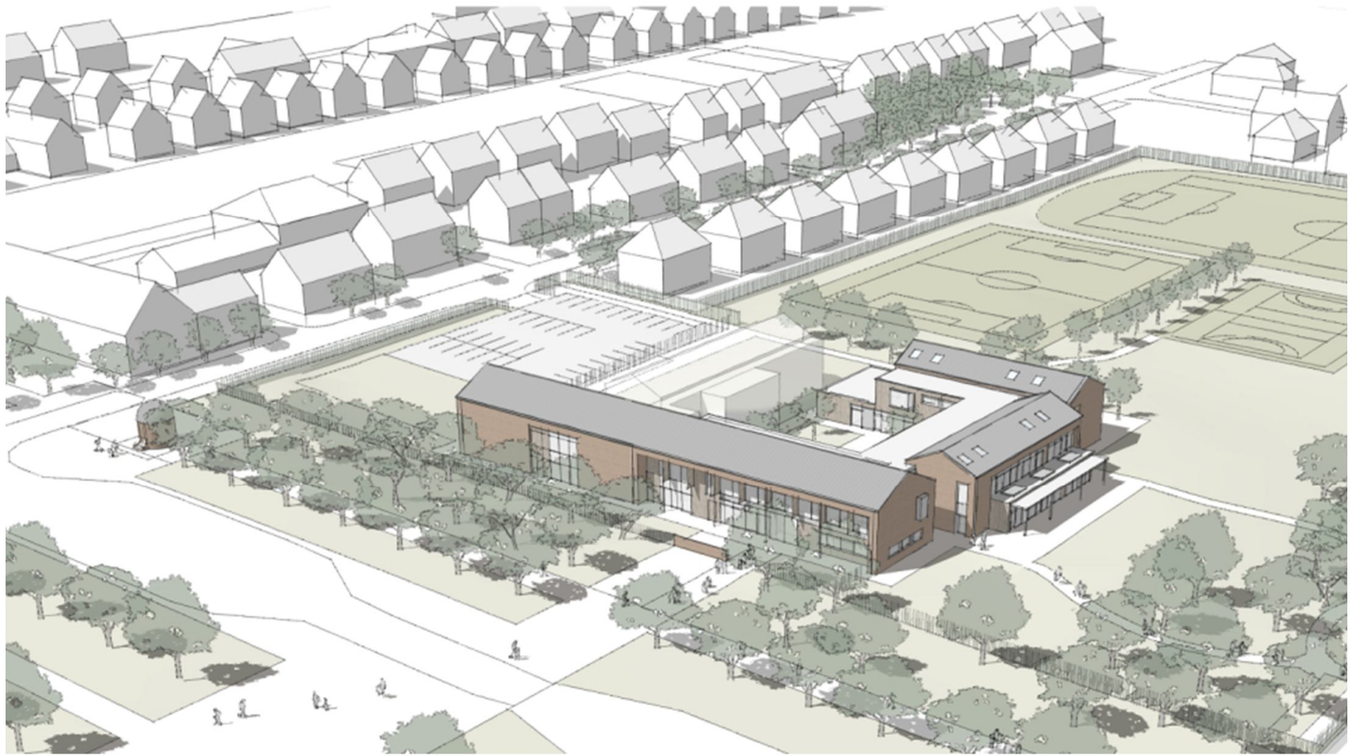
AUE – Cambridge Primary School