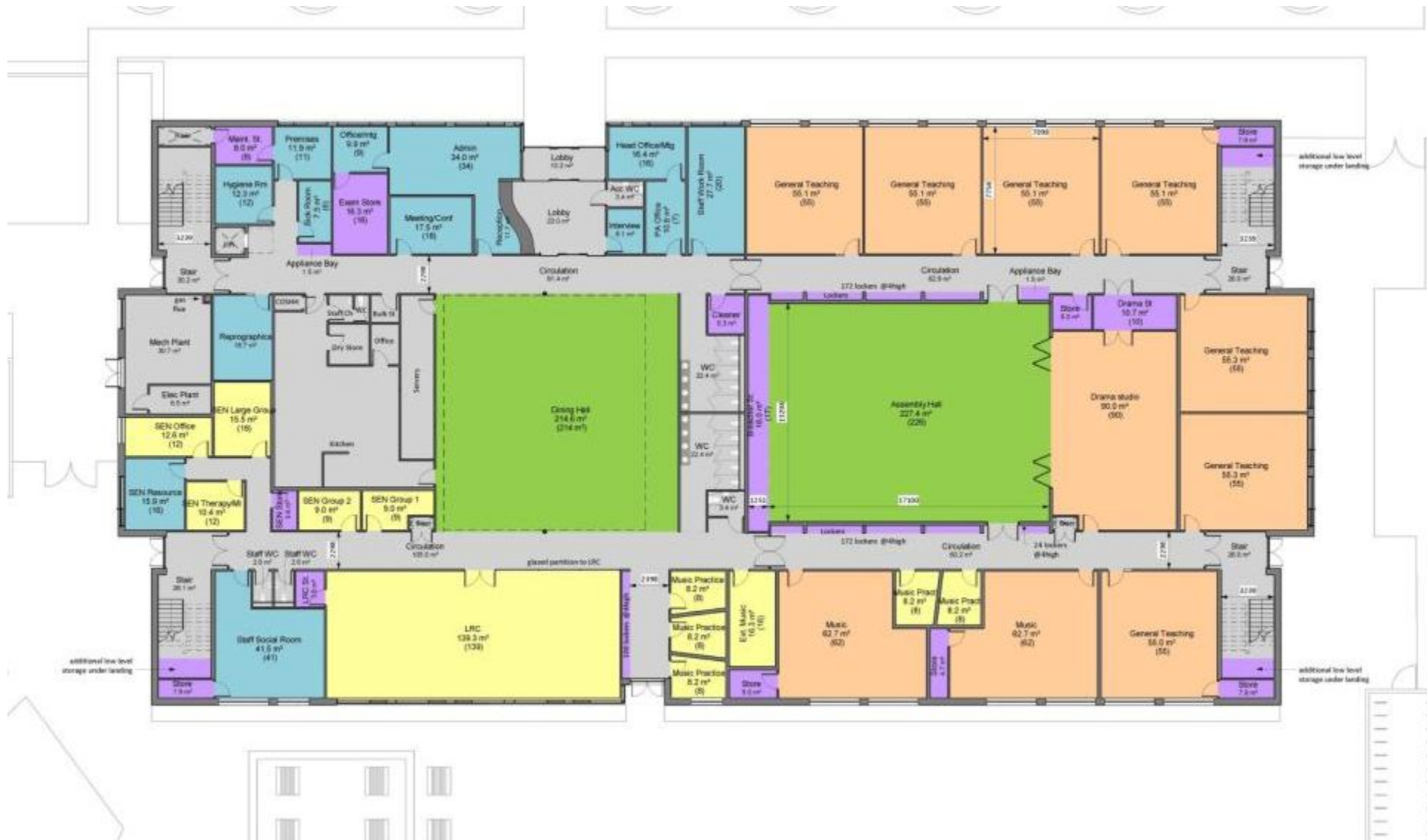
Deer Park Free School (Secondary)