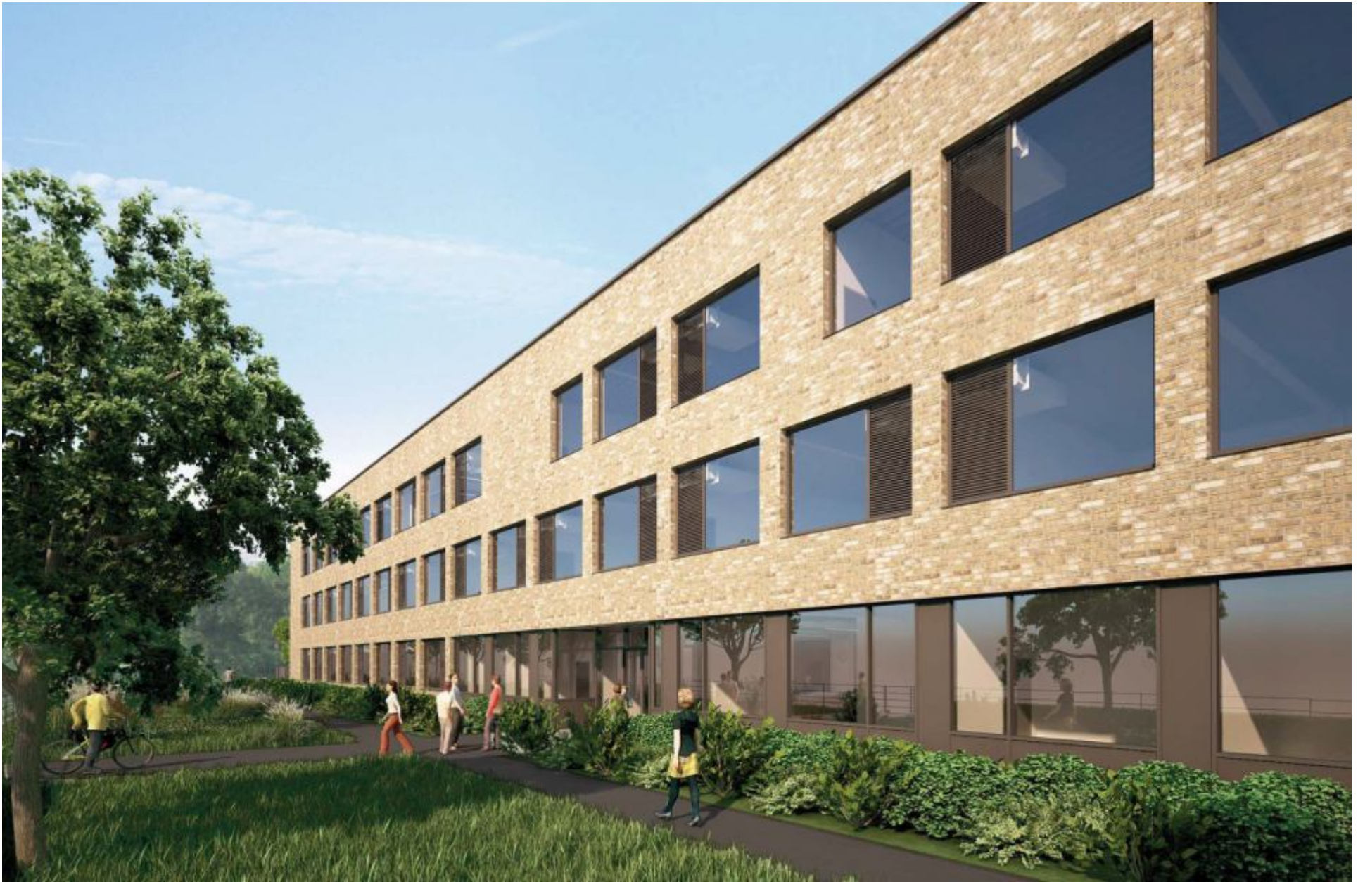
Deer Park Free School (Secondary)