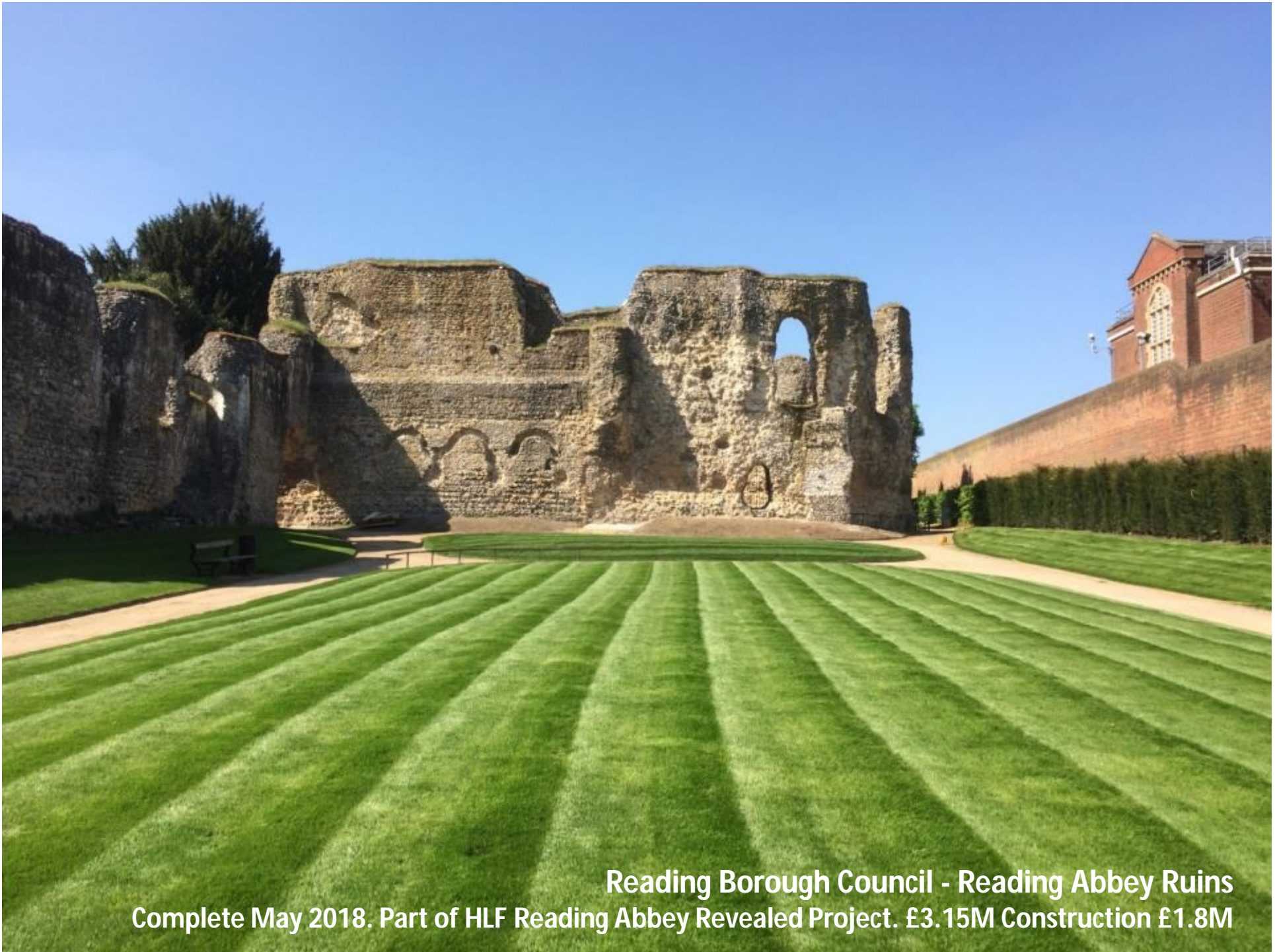
Reading Borough Council - Reading Abbey Ruins Complete May 2018. Part of HLF Reading Abbey Revealed Project. £3.15M Construction £1.8M