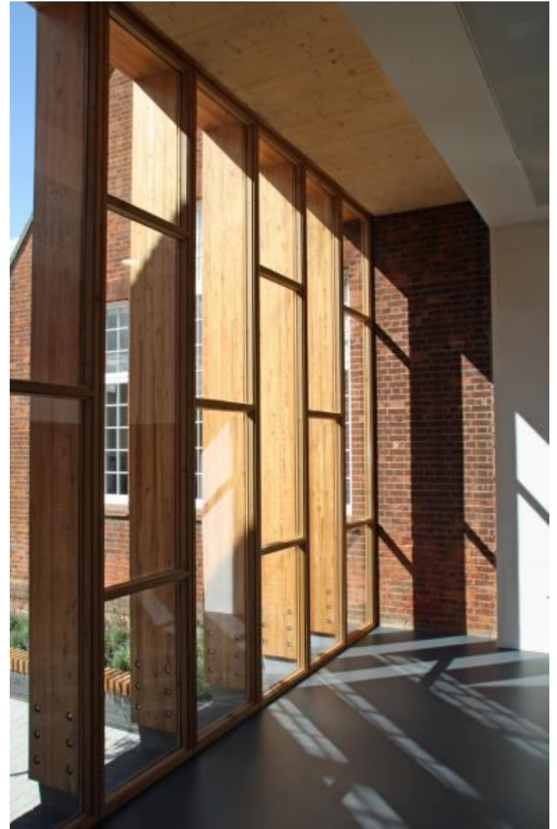
SEN Schools – Rowhill School