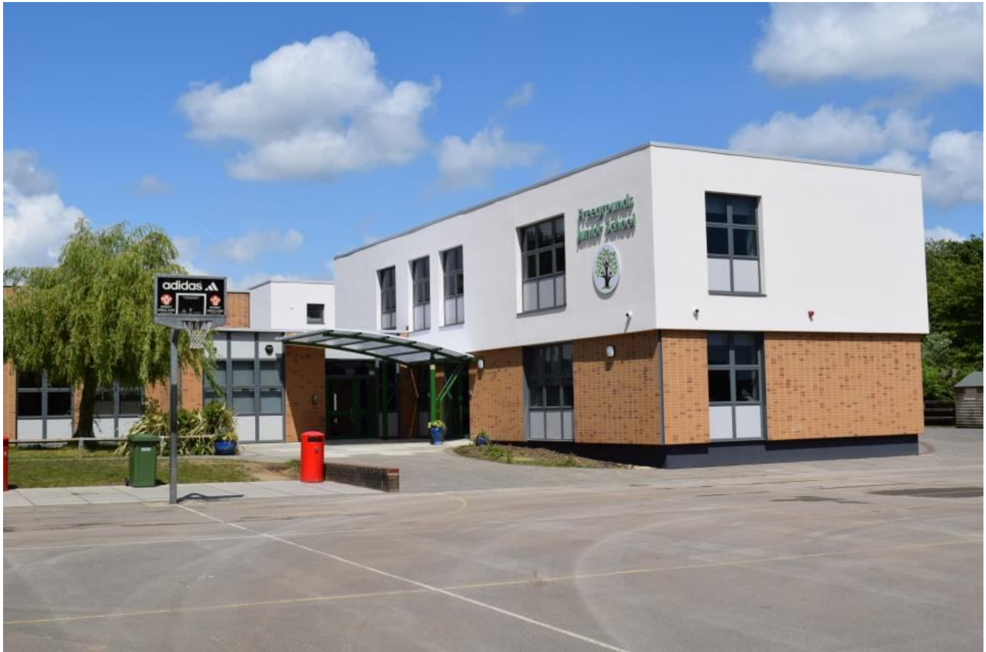
Scola Re-cladding Freegrounds Junior School