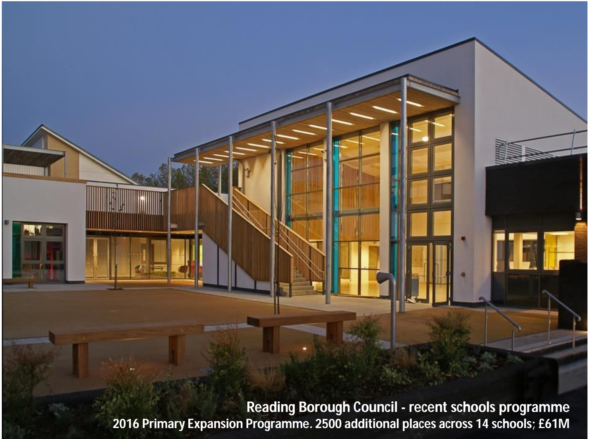
Reading Borough Council - recent schools programme 2016 Primary Expansion Programme. 2500 additional places across 14 schools; £61M