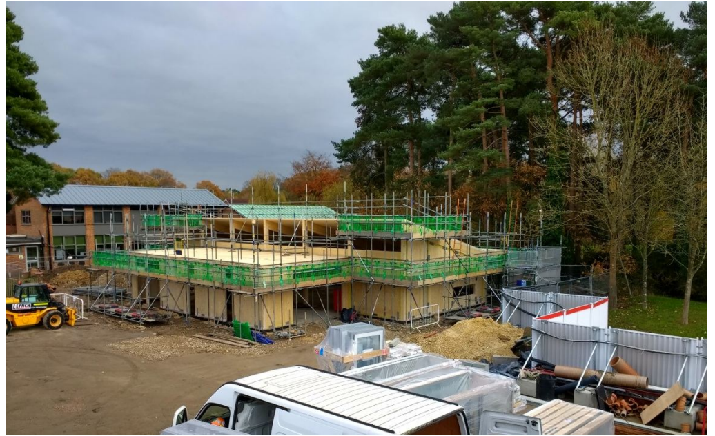
North Baddesley Infant School: Primary Shared Design