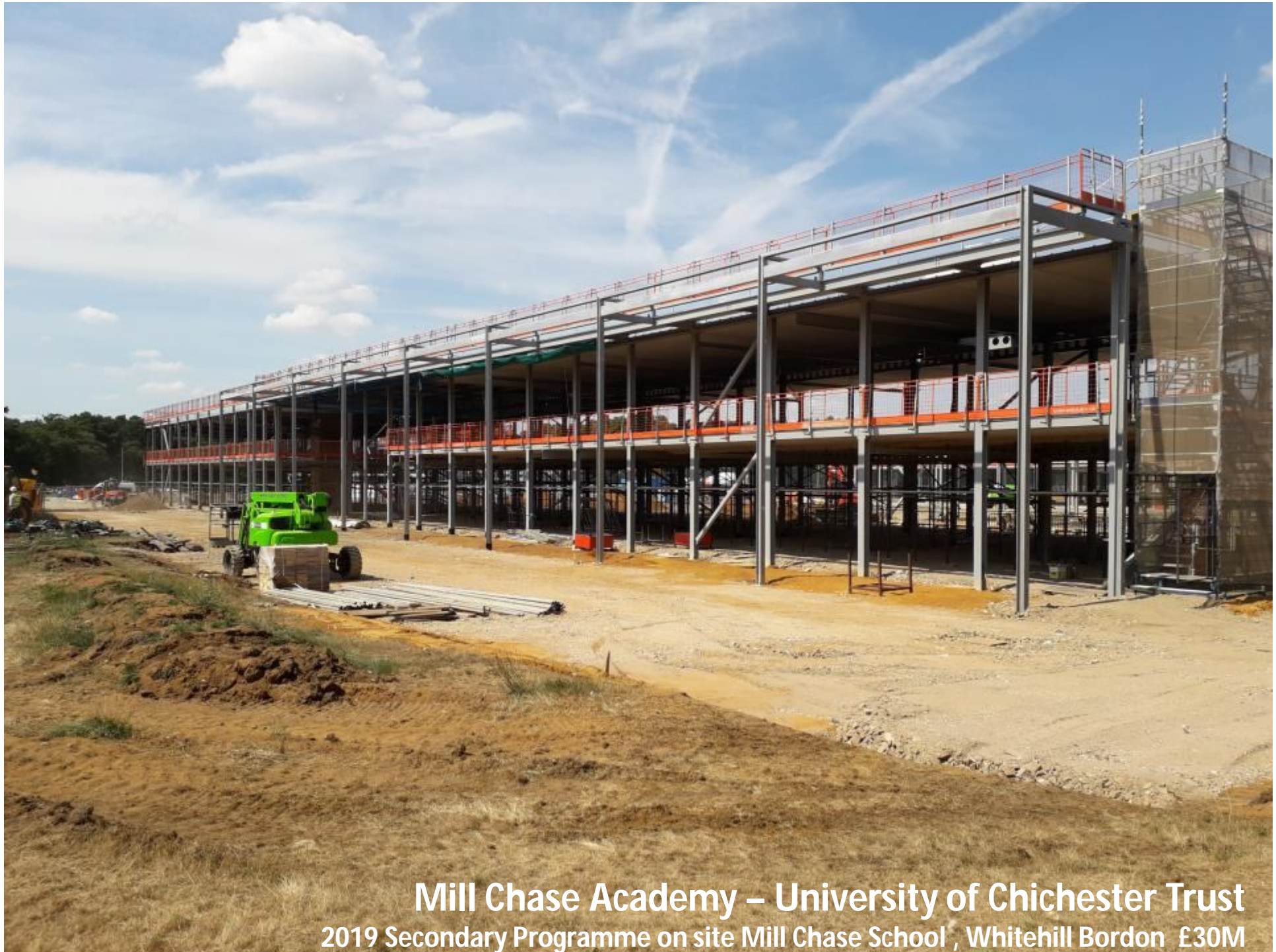
Mill Chase Academy – University of Chichester Trust 2019 Secondary Programme on site Mill Chase School , Whitehill Bordon £30M