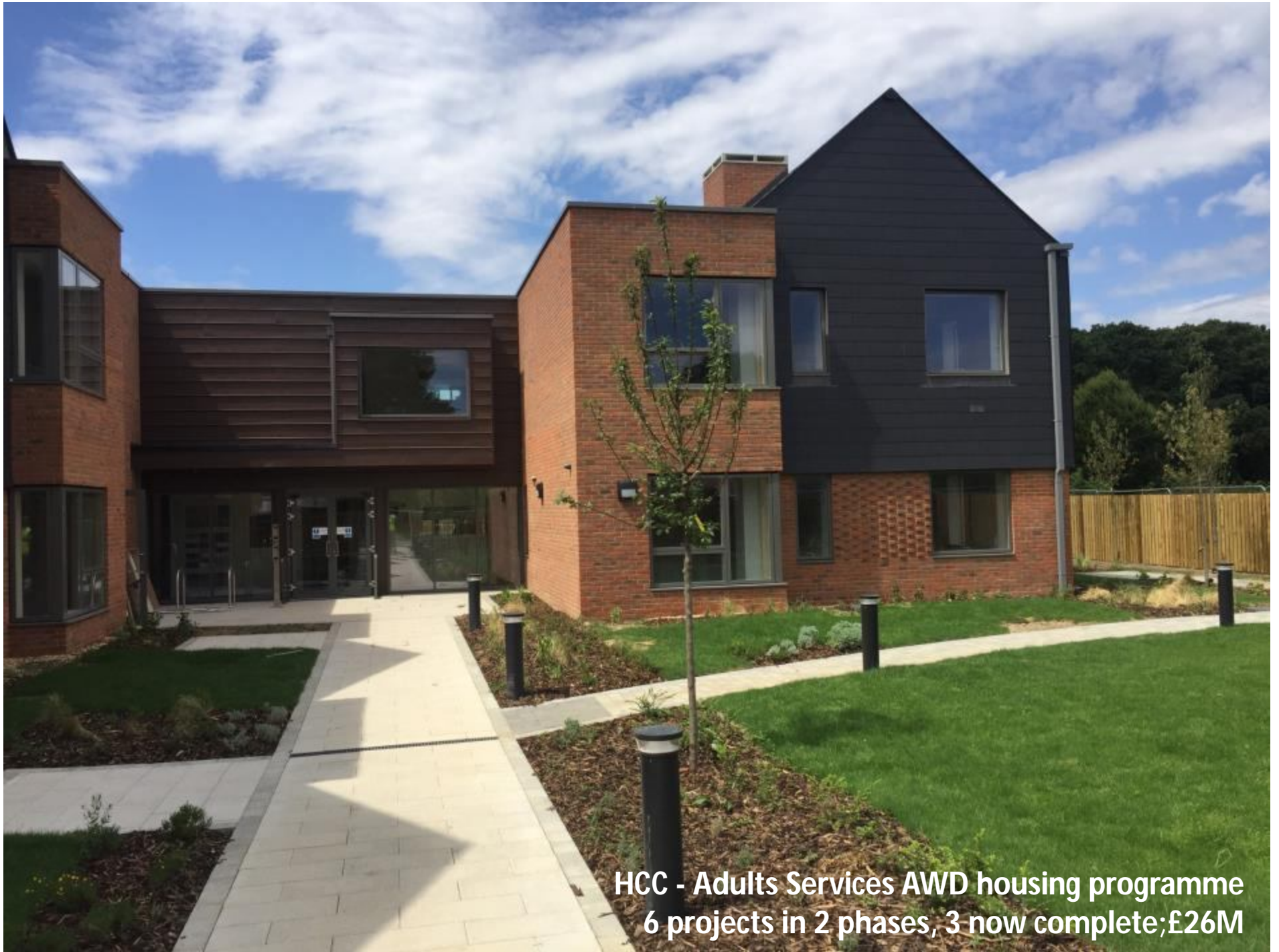
HCC - Adults Services AWD housing programme 6 projects in 2 phases, 3 now complete;£26M