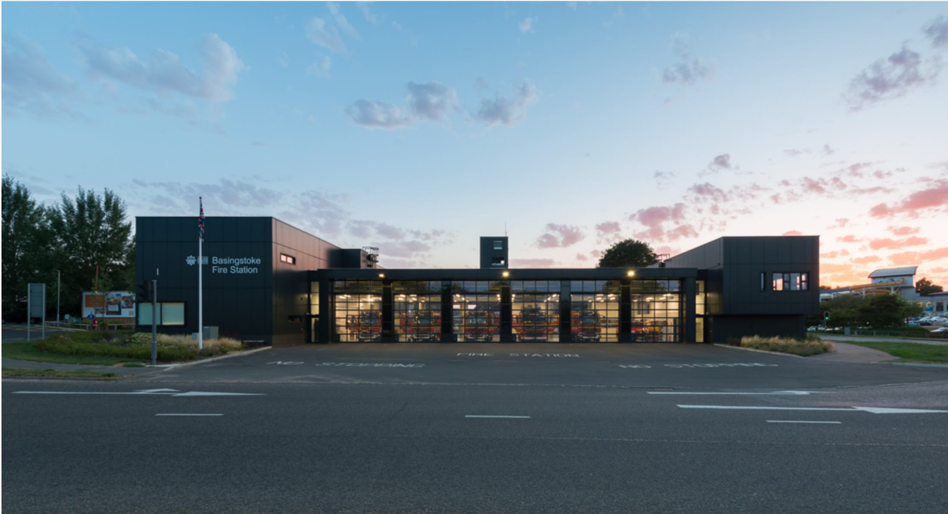
Basingstoke Fire Station