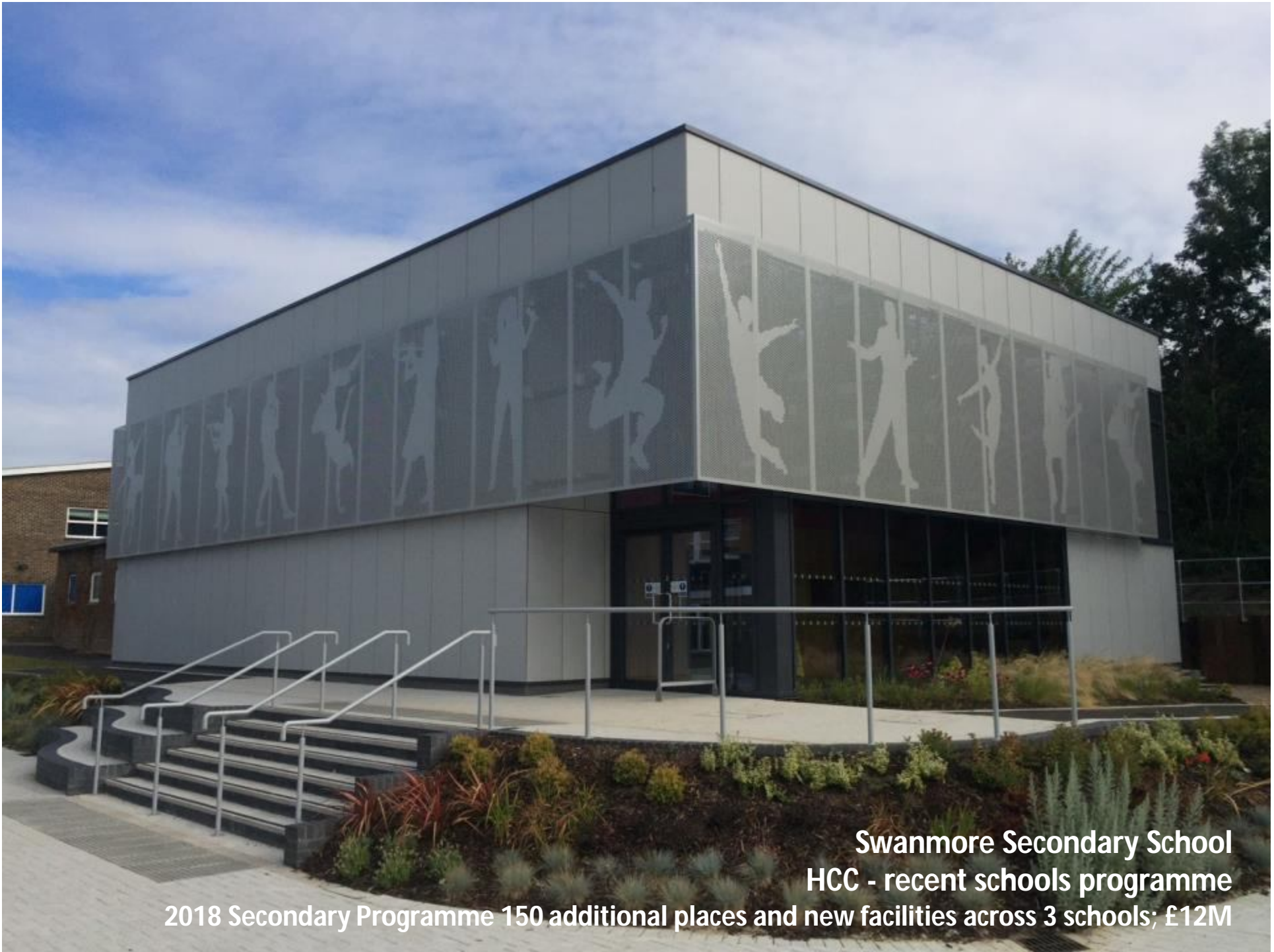
Swanmore Secondary School HCC - recent schools programme

2018 Secondary Programme 150 additional places and new facilities across 3 schools; £12M