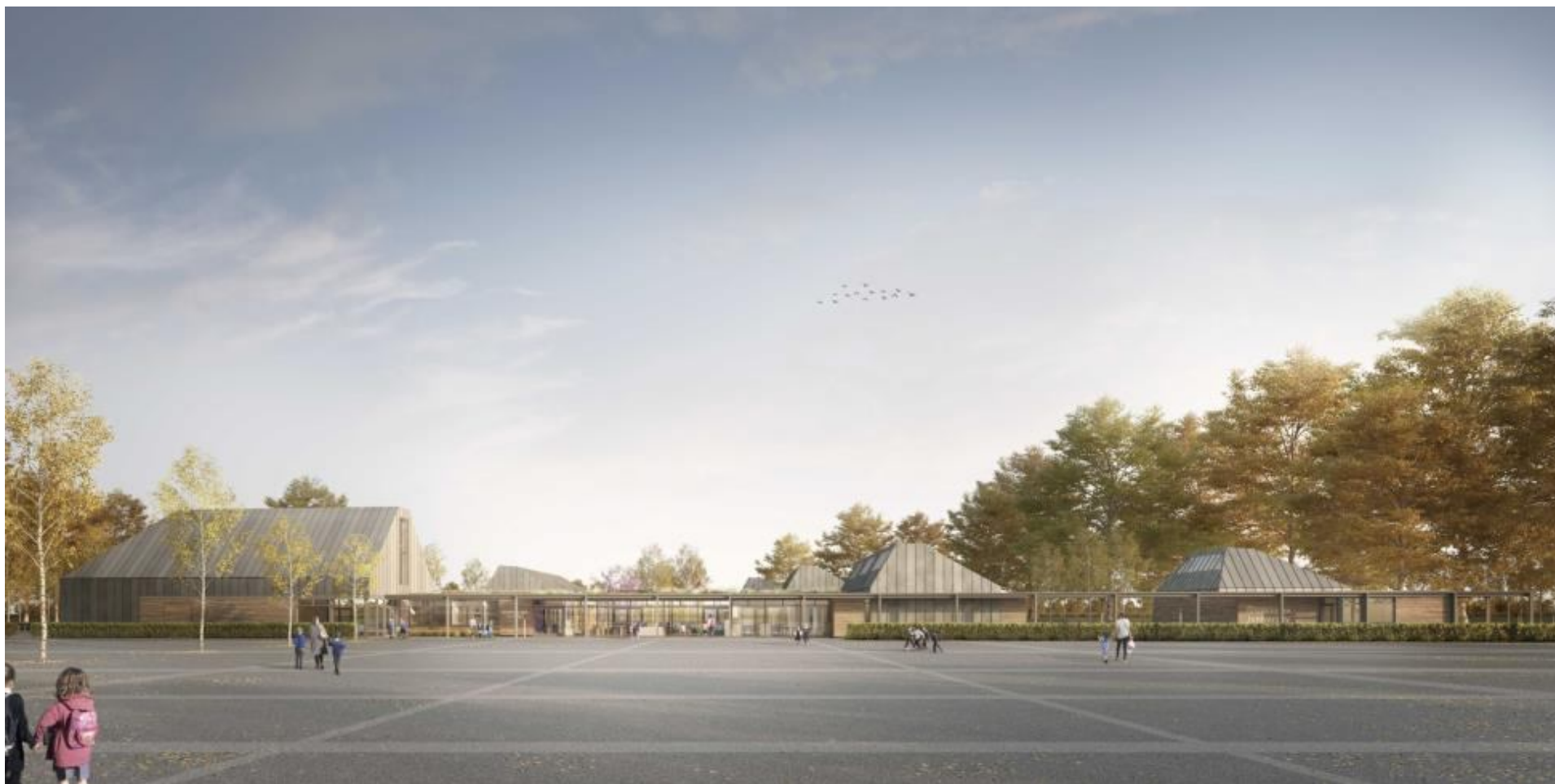
Barton Farm Primary School HCC – future schools programme 2019/20 New Primary Schools. 1785 additional places across 4 schools; £30M