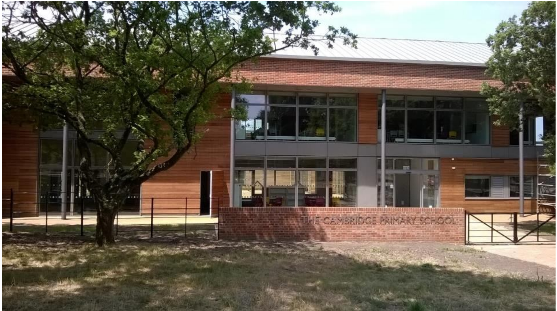
The Cambridge Primary School HCC - recent schools programme 2018 New Primary Schools 840 additional places across 2 schools; £20M