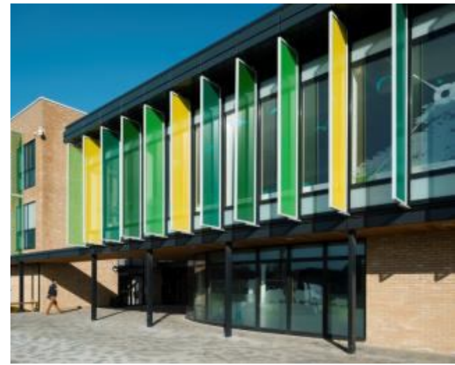
Masterplanning / multiphase site redevelopment Park Community School