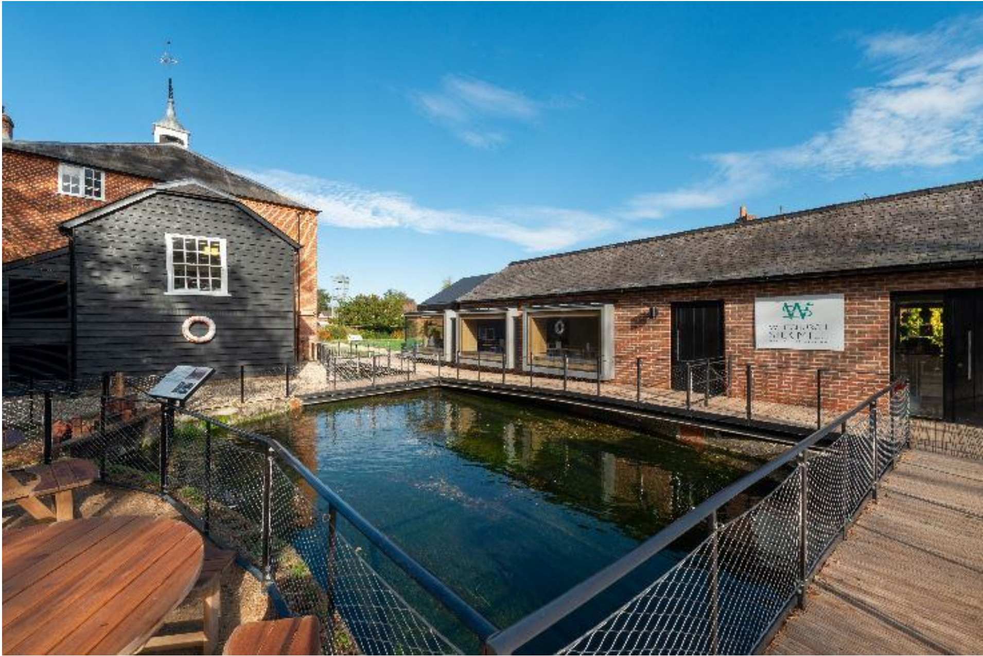
Whitchurch Silk Mill