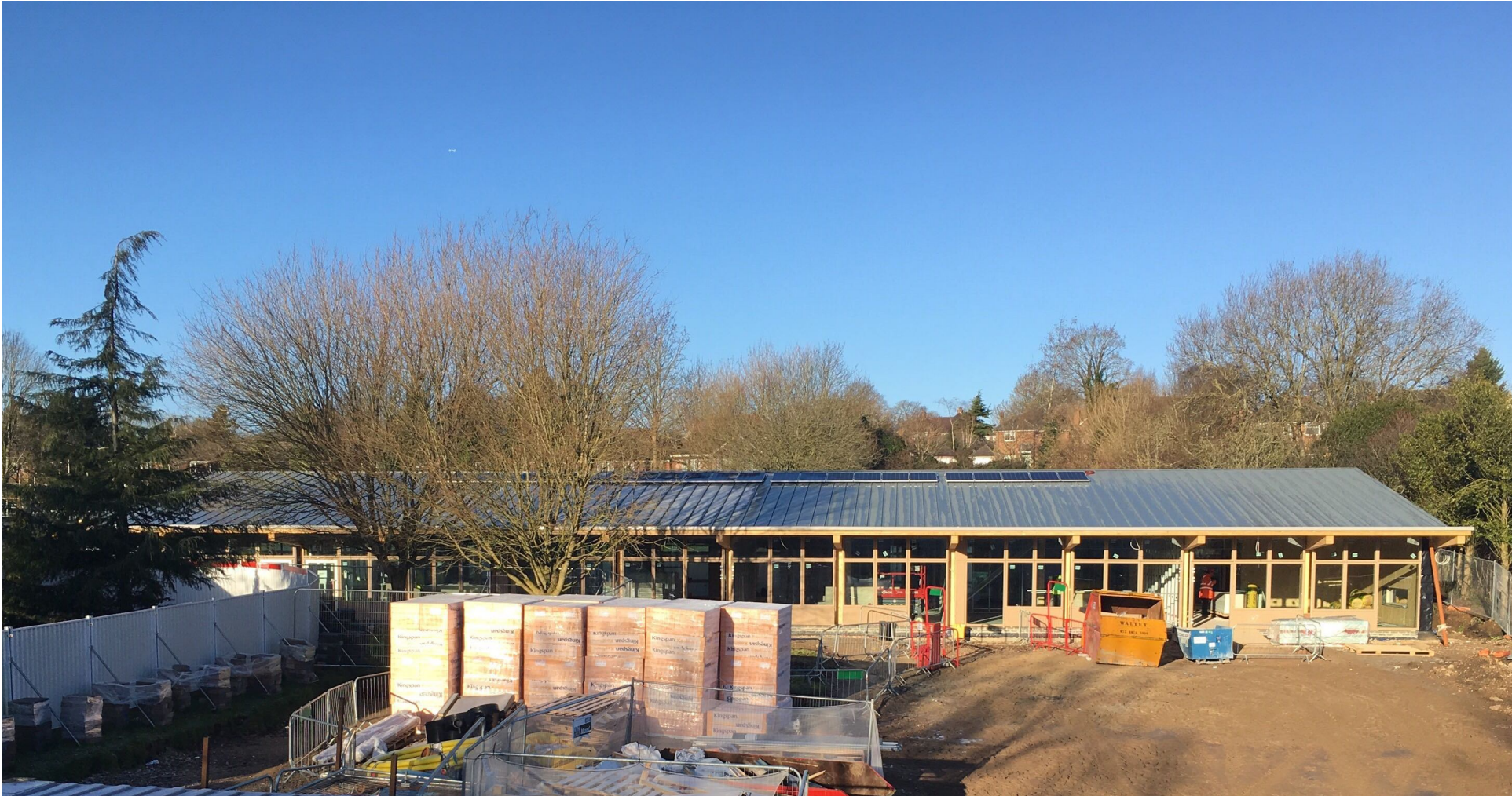
The Butts Primary School