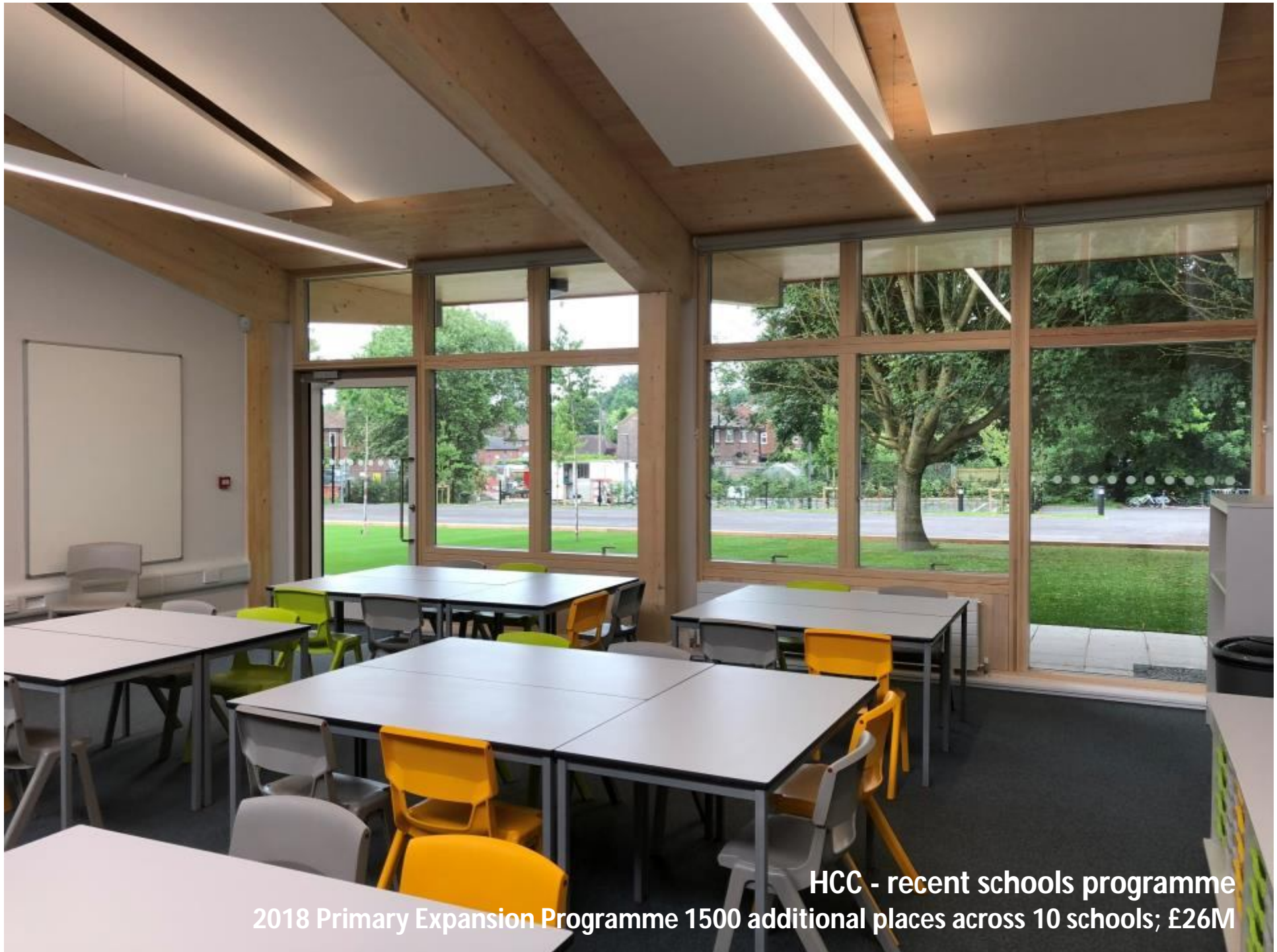
HCC - recent schools programme 2018 Primary Expansion Programme 1500 additional places across 10 schools; £26M