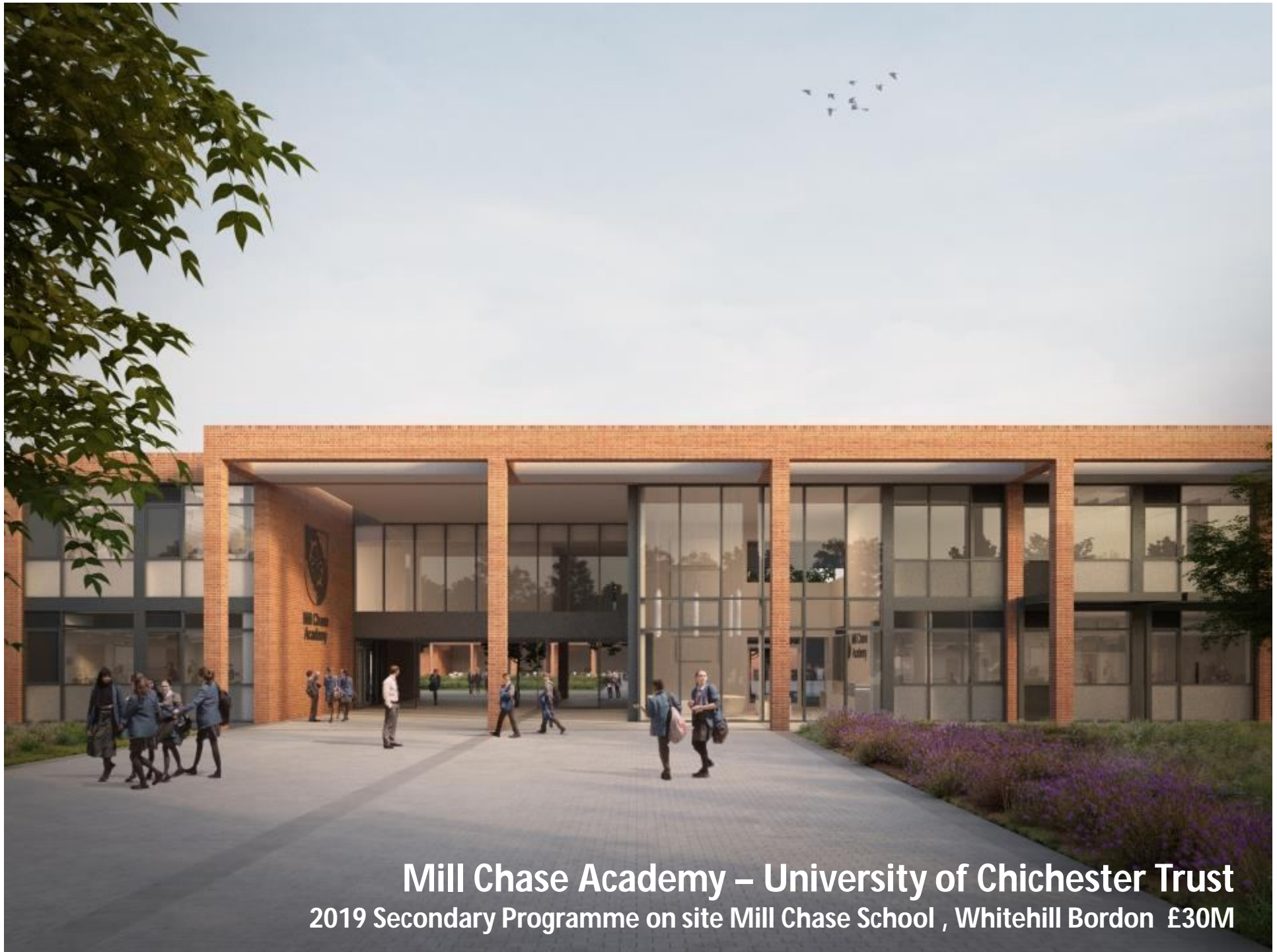
Mill Chase Academy – University of Chichester Trust 2019 Secondary Programme on site Mill Chase School , Whitehill Bordon £30M