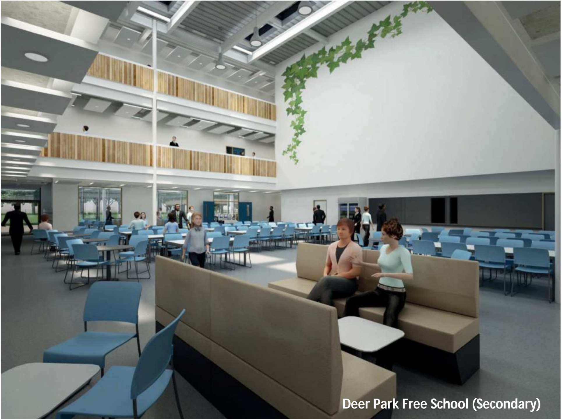
Deer Park Free School (Secondary)