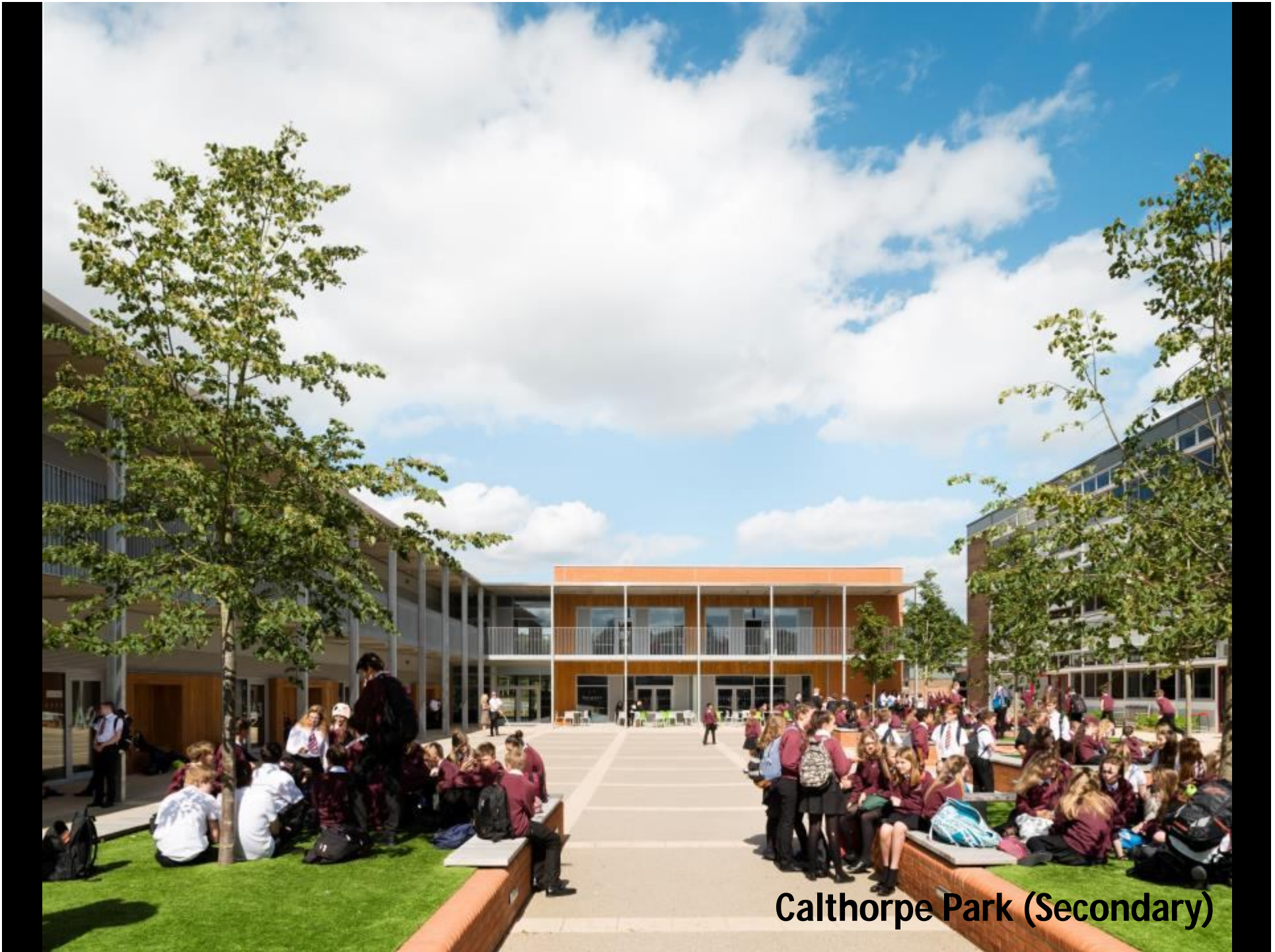
Calthorpe Park (Secondary)