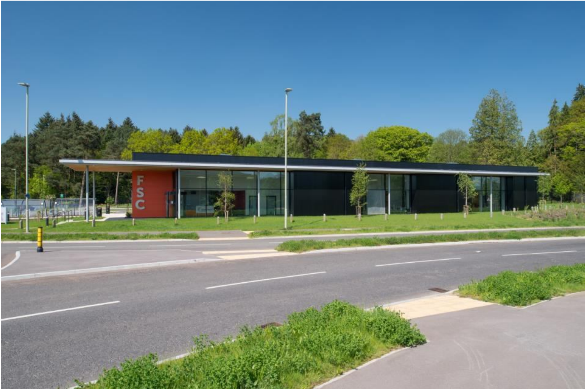
Future Skills Centre, Whitehill & Bordon