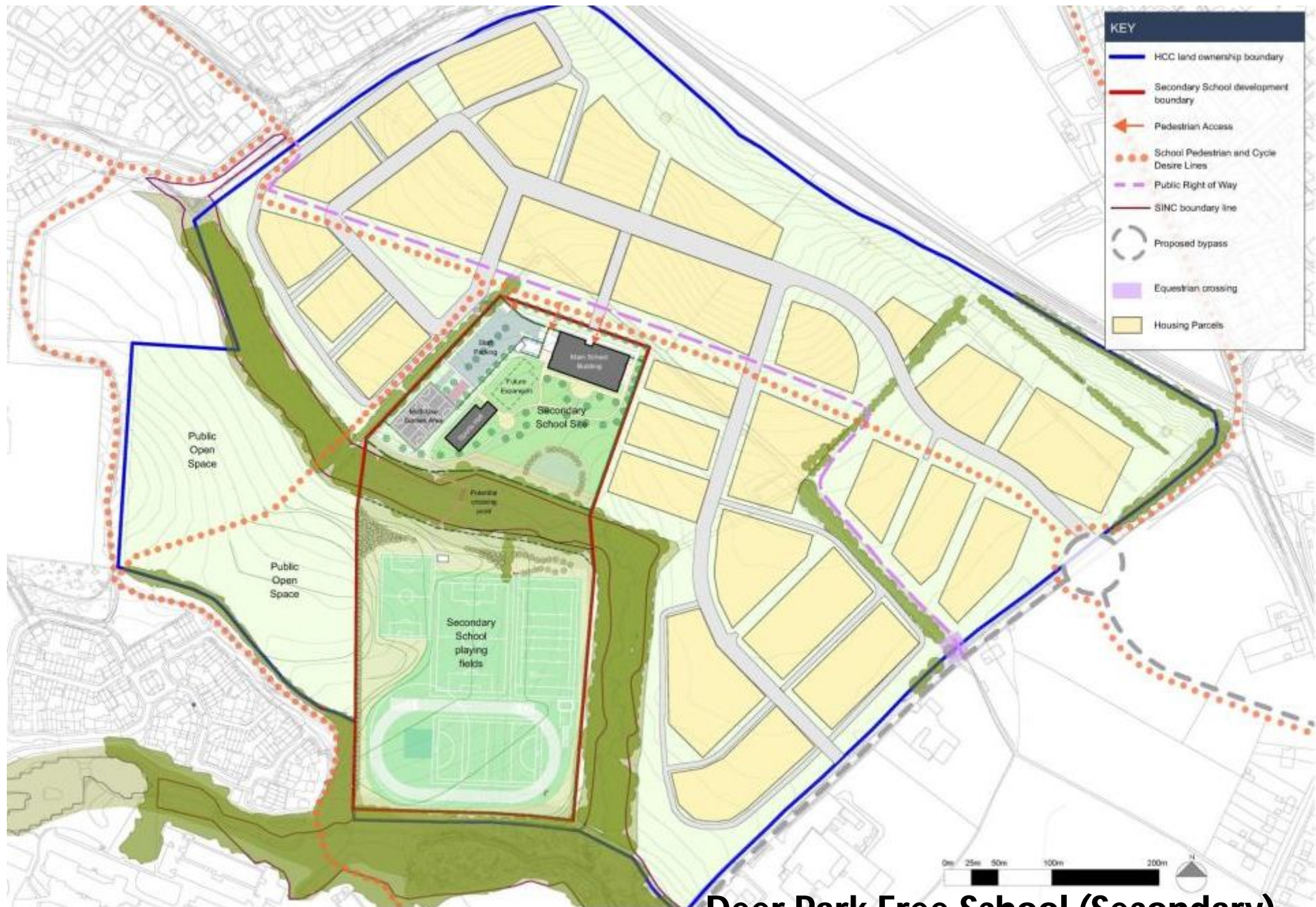
Deer Park Free School (Secondary)