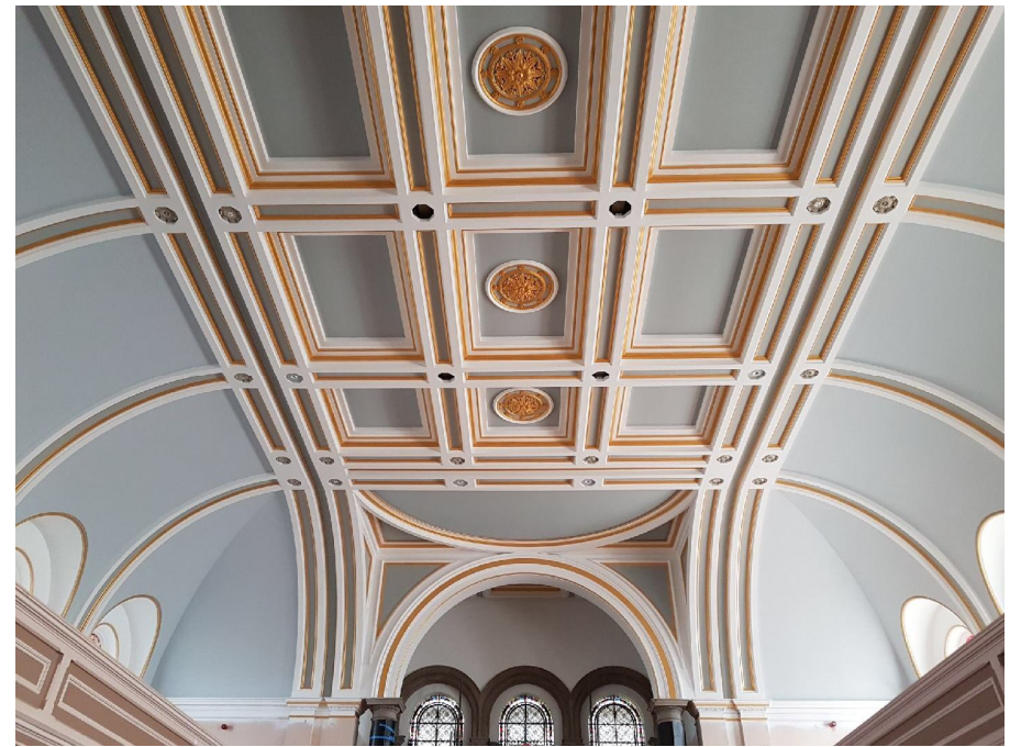
Royal Victoria Country Park Chapel