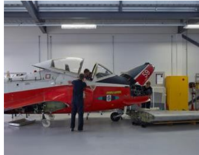
Gateway Building - Education and Skills - CEMAST